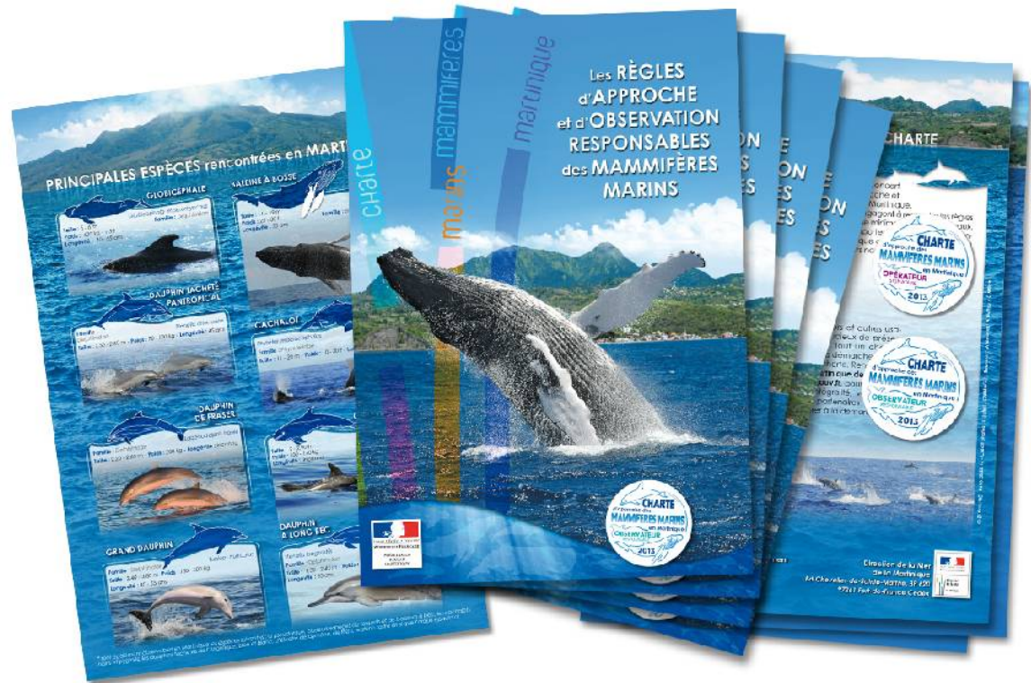
POCHETTE 3 VOLETS